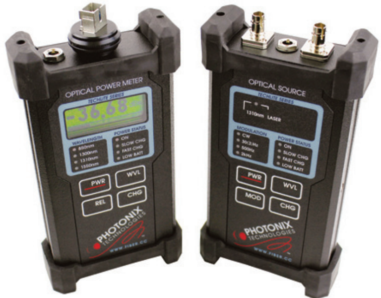
Note: Photos may vary from actual product

The TECHLITE™ series of test sets allow fiber technicians to perform precise optical testing in the field. The meters, when operated in absolute power mode, are used to determine the level of optical power being emitted from a transmitter. In relative mode, the meters are used with the included source to perform fiber loss measurements or splice tuning operations. The TECHLITE™ meter, in relative measurement mode, will store the zero reference reading for all four wavelengths independently in non-volatile memory. This allows all zero references to be taken at one time and also allows the unit to be turned off while moving between locations preserve battery life. The TECHLITE™ meters utilize a graphic LCD screen to create unusually large and easy to read numbers as graphics to indicate power levels.